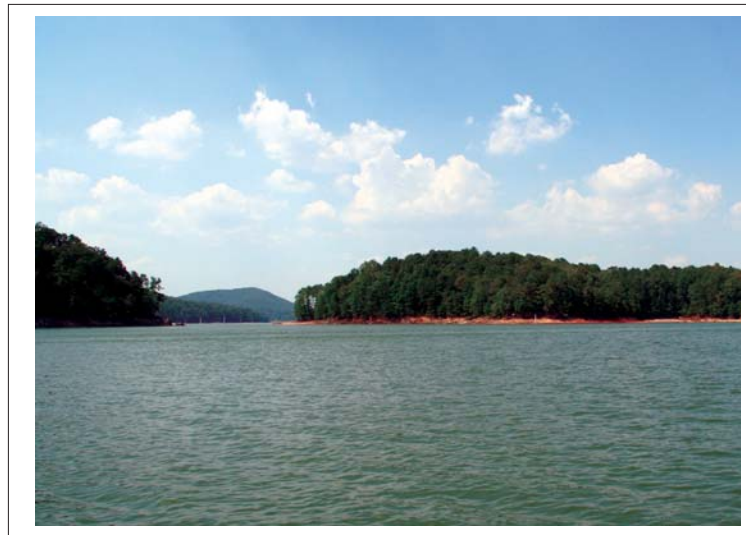
Allatoona Lake in July 2007

While this scenario that I have just described could be very disheartening, and certainly it is, there is a way for you and your family to escape. As it says in Acts 2:38, the first step towards protecting you and your family is the word REPENT. □